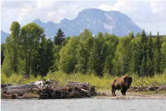
Bison in front of Mt. Moran: Eleanor Barker

Let Barker-Ewing guide you on an unforgettable journey through the heart of Grand Teton National Park. Here along the free-flowing Snake River, you'll experience unparalleled mountain vistas and encounter opportunities to view a breathtaking variety of wildlife. Your scenic float trip takes only a few hours, but the memories will last a lifetime.