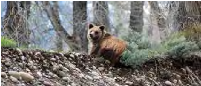
Grizzly Bear: Brett & Jude Haywood

Reservations: local 307.733.1800 toll-free 1.800.365.1800